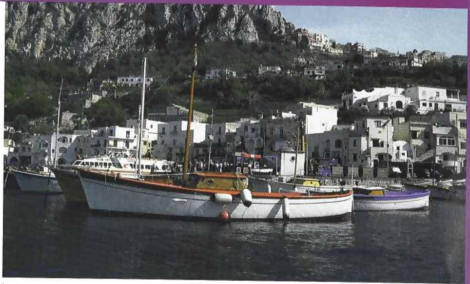
The island of Capri was favored by Roman Emperor Tiberius in the first century A.D.