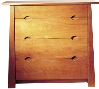
Green Design Furniture Co.

you have to supply), and the newly opened Bike & Boat Store attracts people of all ages. Enjoy fun family events on the L.L.Bean Campus, including the 25th annual Maine summer PaddleSports Festival on June 24 and 25. A summer concert series in the Discovery Park delights listeners every Saturday night from July 4 through Labor Day weekend with jazz, folk, blues, and zydeco.