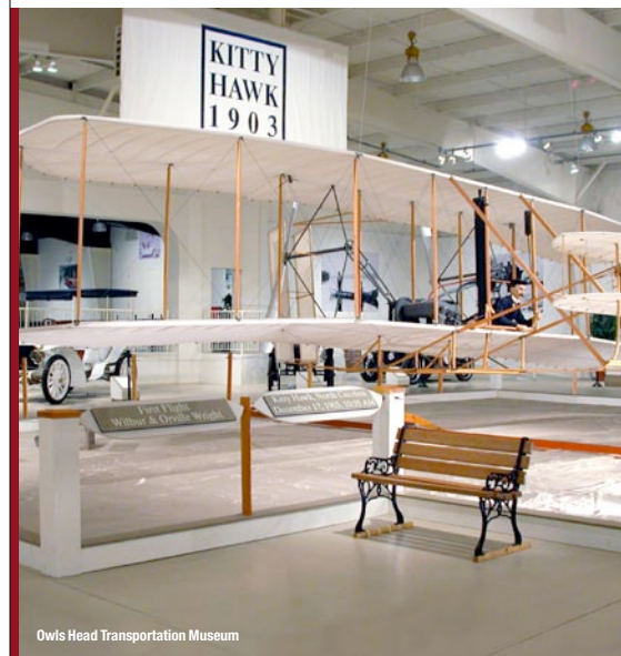
Owls Head Transportation Museum

Forget about the winter woes that Maine conjures in your memory. With all these lovely outdoor adventures, who has time to think of flurries and flakes? There is sunshine for the taking!