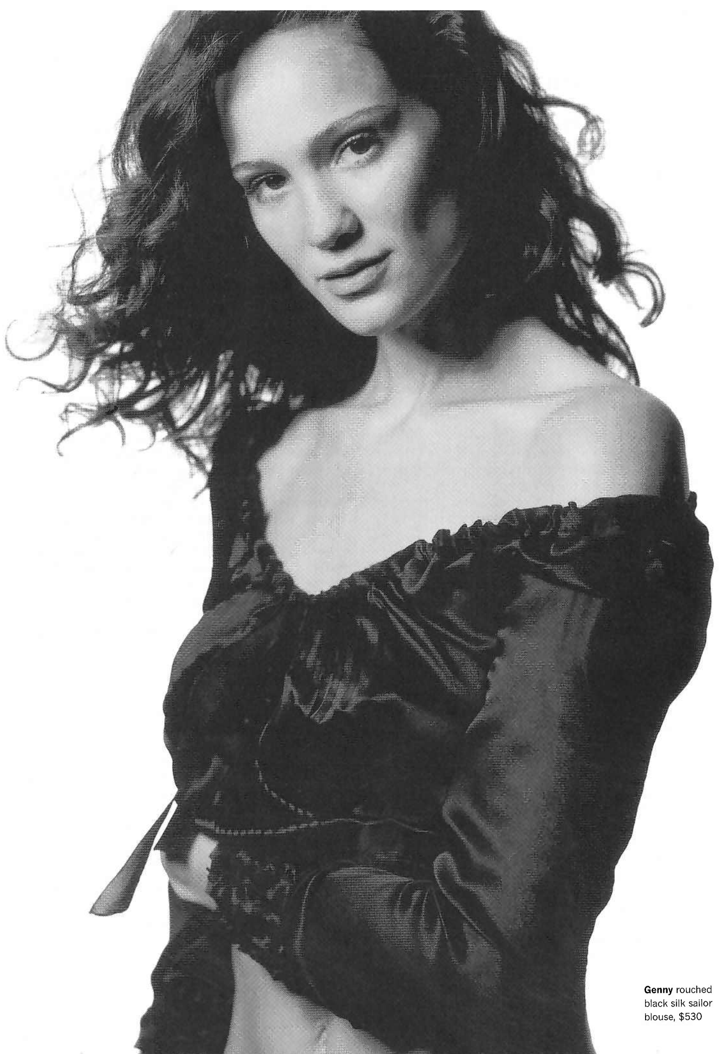
Genny rouched black silk sailor blouse, $530