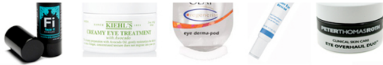
(1) Face It; (2) Kiehl's; (3) Olay Regenerist; (4) Kinerase; (5) Peter Thomas Roth

1. Face It's Eye-perator, $50 — A lightweight, rich treatment that forms a protective film around the eyes. Consider it covering up from the cold.